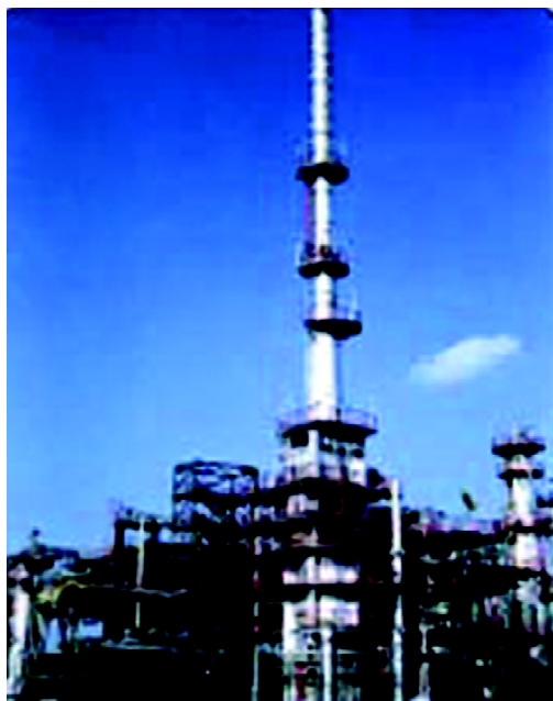
Fig. 5.5: A petroleum refinery

separating the various constituents/ fractions of petroleum is known as refining. It is carried out in a petroleum refinery (Fig. 5.5).