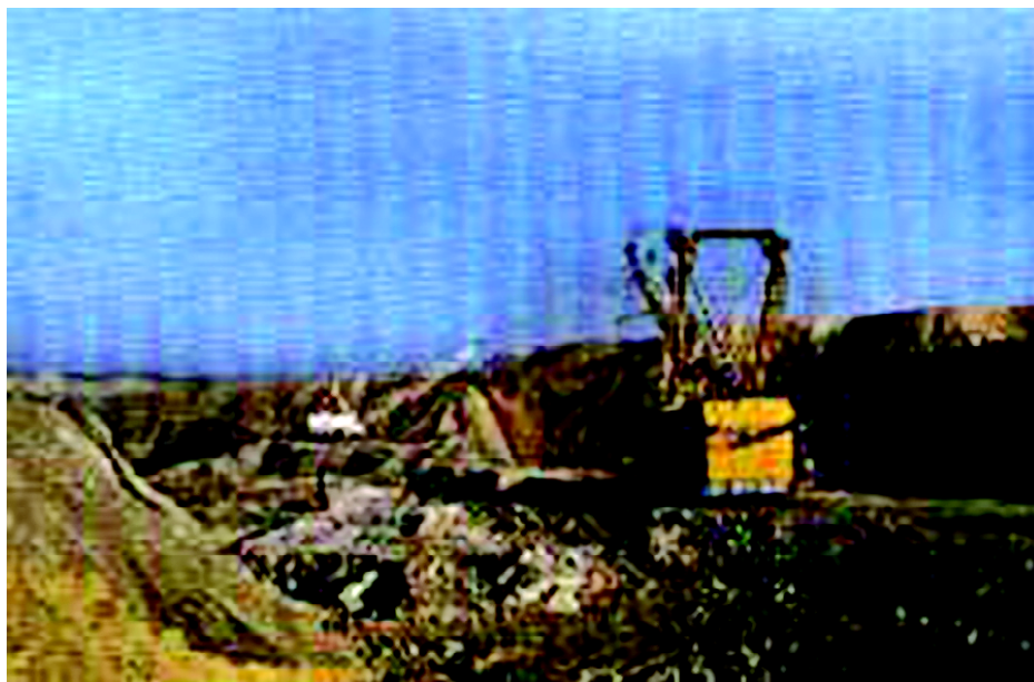
Fig. 5.2: A coal mine

When heated in air, coal burns and produces mainly carbon dioxide gas.