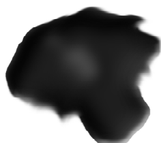
Fig. 5.3: Coal tar

It is a black, thick liquid (Fig. 5.3) with an unpleasant smell. It is a mixture of